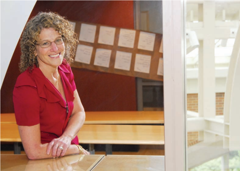
The firm continues to use 8-by-9-inch sticky notes for process mapping along with a software version chosen by Carla Goldstein's team.